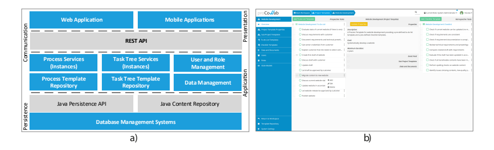
Fig. 3. Architecture and Screenshot of the proCollab Tool

Finally, we prepared a screencast available on bpm2017demo.procollab.de to demonstrate proCollab. The screencast illustrates the key aspects of the proCollab framework using the scenarios of developing a website and conducting a surgery.