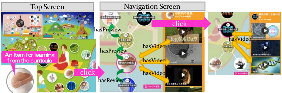
Fig. 2. Screenshots of Rikamap

In this section, we will introduce Rikamap, which not only allows learners to learn with videos whose content suits their interests, but also allows them to navigate between and watch videos corresponding to preparatory and review items. As the screenshots in Figure 2 show, when the learner clicks on an icon representing a learning item in the Top Screen, they are taken to the Navigation Screen. The Navigation Screen displays relevant learning paths corresponding to that icon (marked "hasReview/hasPreview" in the figure) and related videos (marked "hasVideo"). These relationships are dynamically generated from the learning path data. Using Rikamap, learners can prepare and review according to their own understanding.