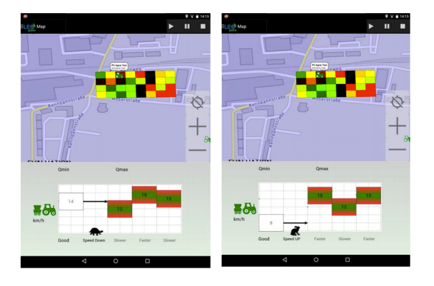
Fig. 4. Example of the Speed Predictor (Smart Fertilization Functionality)