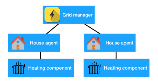
Fig. 1. Overview of a simple smart grid system

Tim Molderez is supported by the FWO-SBO-SMILE-IT project, funded by the Research Foundation Flanders (FWO)