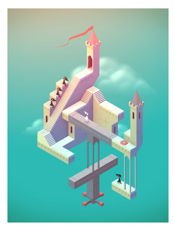
Figure 2. The game Monument Valley is widely described as a relaxing puzzle game due to both game mechanics with a calm pace, and calming background music.

This puzzle game by ustwo consists of M. C. Escher-style level designs (see Figure 2), which the player can rotate in three dimensions while the camera remains fixed in a two-dimensional perspective (which are reminiscent of Fez [10]).