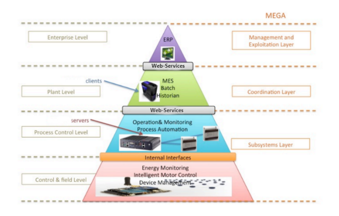
Figure 1: MEGA platform functional levels

existing devices, but once a successful integration has been done, new requirements has been observed. The lack of a standardized vocabulary that allows a more in-depth relationship definition along with their properties decrease the future growth of the developed system. As presented in Figure 1, interfaces driven by the web services mechanism (primarily SOAP) are in charge of relaying information between different layers. This communication is made without any vocabulary nor correlation between the implied subsystems.