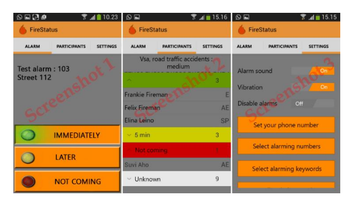
Fig. 2. Screenshots of the FireStatus App

The app was developed in a student project<sup>6</sup>. Its main features include receiving and responding to emergency messages (Screenshot 1 in Fig. 2.), checking the responding situation of the incident calls (Screenshot 2), and various settings of the alarm sound, the keywords, incident dispatching number, etc. (Screenshot 3).