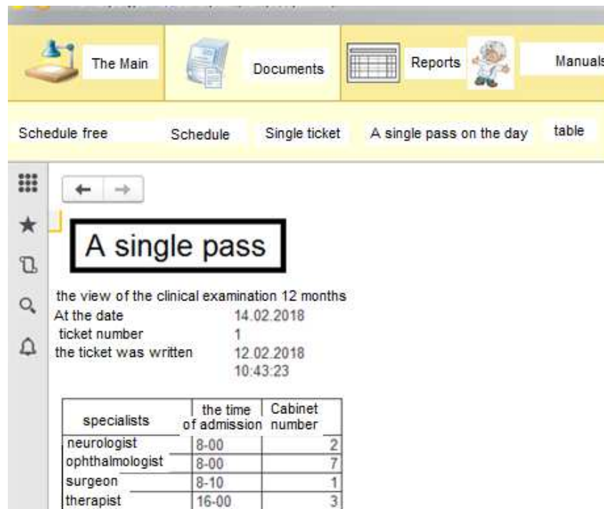
Fig. 2. The formation of a single card for medical examination

After filling of reference books it is necessary to fill in the section "SCHEDULES of WORK" in which the schedule of doctors according to types of examinations contains (see Fig.2).