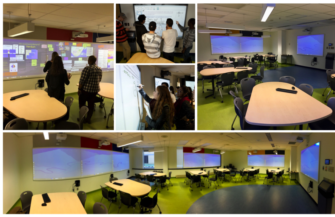
Figure 1. Photographs of the Dawson Future Learning Spaces (classrooms).

In addition to the local instantiation of the DALC, an inter-institutional network of PLCs, called SALTISE, acts as a resource, a support, and a driver of change. It fosters the development and research of tools and resources for active learning pedagogical innovations and as such provides another type of third space (this