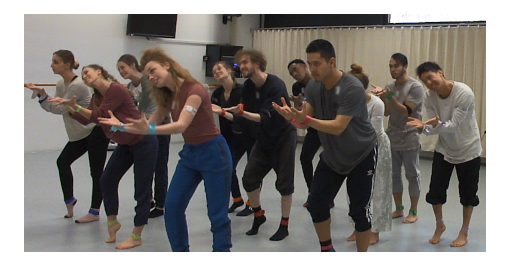
Fig. 3. Mid head-turn, last movement of the dance

at conferences [4,11,21]. Postprocessing and analysis is then supported by the Ubicon software platform [3].