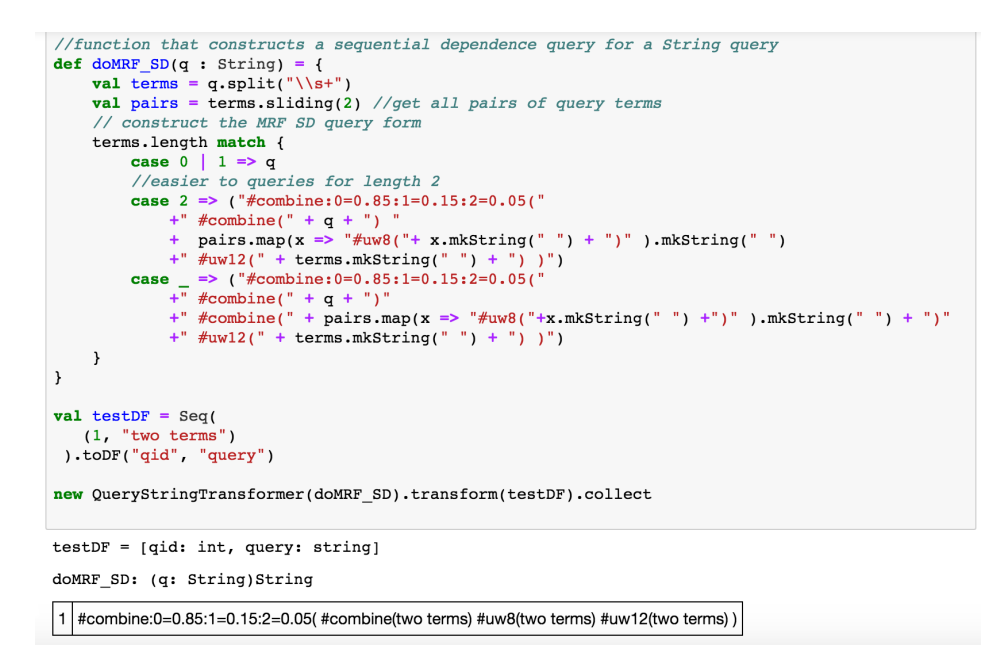
Figure 1: Example of applying a Transformer to apply sequential dependency proximity to a dataframe of queries.

Jupyter notebooks are interactive in manner, in that a code block in a single cell can be run independently of all other cells in the notebook. As a result, Jupyter is also increasingly used for educational purposes - for example, teaching programming within undergraduate degree courses [4, 18], as well as a plethora of data science or machine learning courses [15]. O'Hara et al. [13] described four uses for notebooks in classroom situations, including lectures, flippedclassrooms, home/lab work and exams. For instance, the use of notebooks within a lecturing situation easily permits the students to replicate the analysis demonstrated by the lecturer.