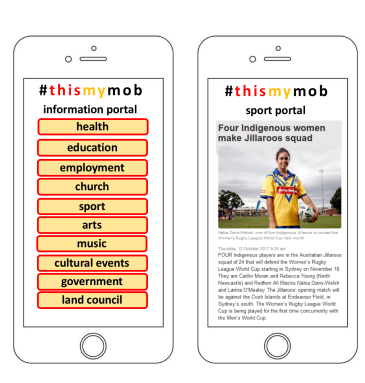
Fig 3. Information portal