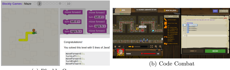
(a) Blockly Games

Learn computer science and how to programming with blocks 3