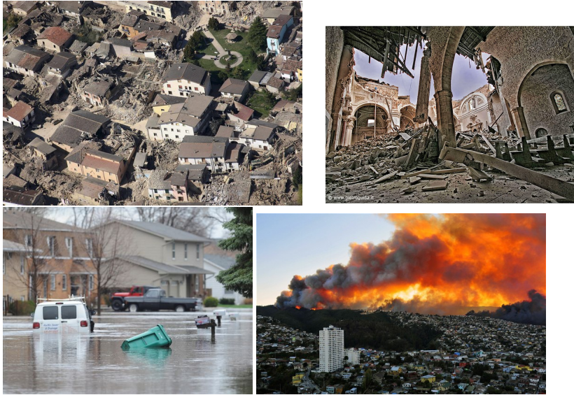
Fig. 1. Bottom left Flooding : USA, 2010; Bottom right Fire : Chile, 2012.