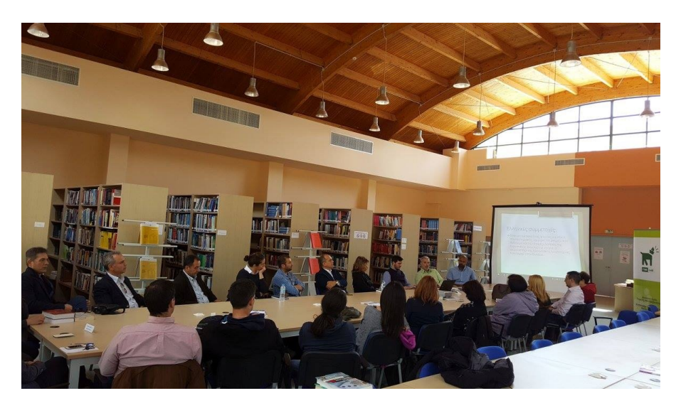
Fig. 2: A meeting with regional stakeholders of culture