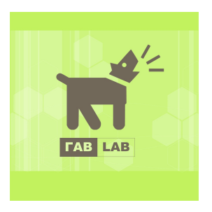
Fig. 1: The \Gamma AB LAB logo