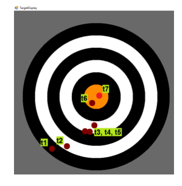
Figure 2. QB Screenshot.

A screenshot of the game can be seen in Fig. 2. Seven shots were fired. The seventh (t7) hit the target. The messages exchange among EI, QB and the user takes the name of feedback loop. So, for example, let the user play whit the emotion of Calm. At the beginning of the interaction, in order to alter his emotional state, a picture is presented to the user. The EI detects such emotional alterations and sends a feedback messages to the user (an arrow in the target: t1, in Fig.2).