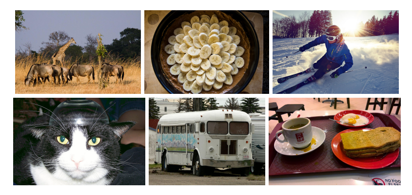
(b) Negative examples of adverts correctly ignored by ADNet.