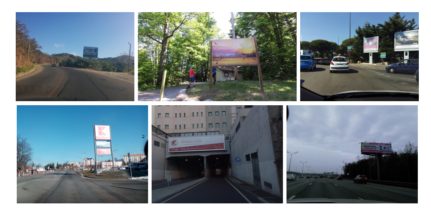
(a) Positive examples of adverts correctly identified by ADNet.