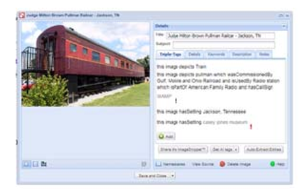
Figure 4. Use of chained triples in the Triple Editor

In cases like this, the concepts used by the SME are often more specialized, reflecting their expertise, than those found in the conceptual corpus. For example, a vehicle may be identified as a rare 1953 Fletcher prototype (one of only two still in existence) rather than simply a military vehicle, which is the best suggestion made by