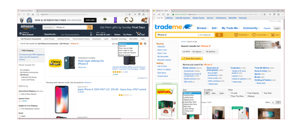
Figure 1: Amazon (left) and Trademe (right) result orderings for query "iPhone X"

SIGIR 2018 eCom, July 2018, Ann Arbor, Michigan, USA