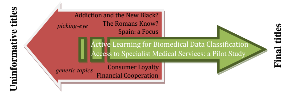
Fig. 3. Filtering step

Filtering step allowed dropping less informative titles so that one can take advantage even of poor models reducing a risk to present misleading picking-eye headings or generic topics to an end user (cf. Figure 3 for examples of generated texts).