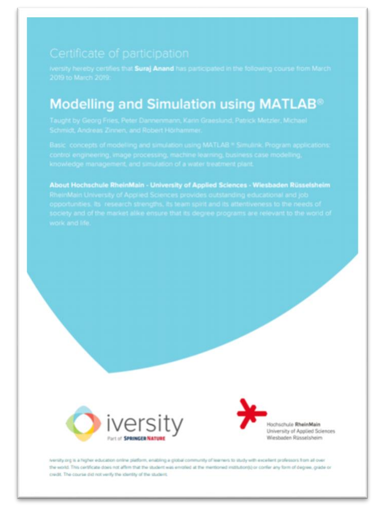
Fig. 4. Certificate of Participation from an archived MOOC.