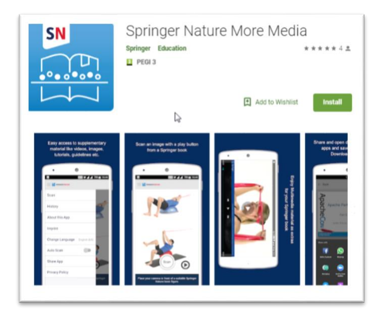
Fig. 2. Springer Nature App. The SN More Media app uses augmented reality (AR) and image pattern recognition features to facilitate access to supplementary electronic material for scientists, professionals and students via their smartphone or tablet. It's designed to allow easy access to supplementary material like videos, illustrations, handouts, Q&As or guidelines that are otherwise hidden in online articles and chapters in Springer Nature books or journals. All books with the Springer Nature Multimedia logo include material that can be accessed with this app.

The most important feature of this innovative textbook is that it includes links to the material contained in the MOOC, which the authors consider relevant. The textbook will feature multimedia content, such as videos and augmented reality, which can be accessible by PC, tablet, or any other mobile device. Students who buy the print book can easily access this content through the Springer Nature More Media App, optimized for cell phones and tablets. Readers simply scan the image with their cell phone or tablet and they are taken directly to the video, figure, photo, table, PowerPoint slide, etc. Moreover, this content can be shared via other apps, email, messengers, and more.