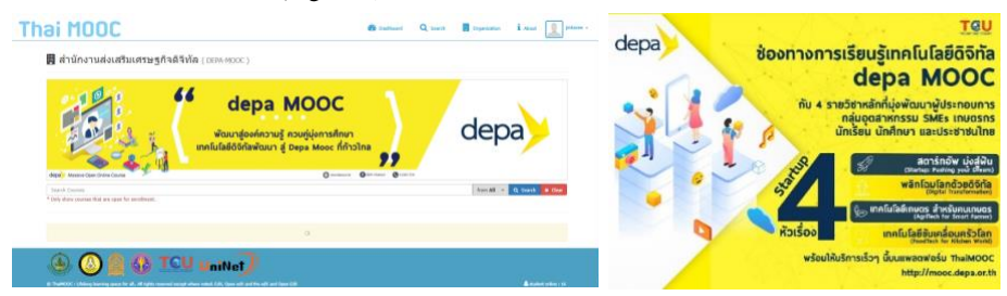
Figure 6 Thai MOOC microsite offering courses from organizations to be used for professional development. For example, thaimooc.org/site/DEPA-MOOC has developed five courses aimed at developing SME entrepreneurs and farmers. At present, it is in the testing process.

Both domestic and international organizations can request a space on Thai MOOC to develop courses for the public without profit or commercial purposes. In addition, teachers in educational institutions and universities can write a letter to request the publication of existing courses according to the conditions of the OHEC. Students can request use of the space to develop media for research or theses in accordance with the conditions of the OHEC. Also, a microsite has been developed for educational institutions interested in using Thai MOOC in their organization to expand usage and achieve maximum benefit (Figure 6).