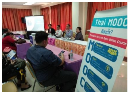
Figure 2 The 1<sup>st</sup> Asia-Pacific MOOCs Stakeholders Summit (Thailand)