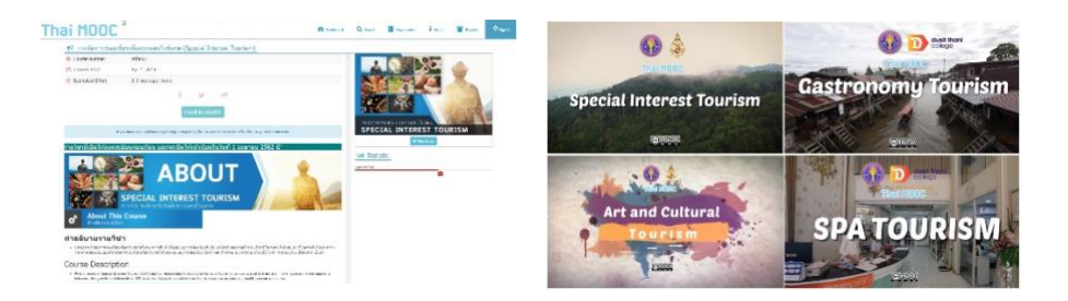
Figure 5 Special Interest Tourism course – cooperation between three partners: Thai MOOC, K MOOC and J MOOC

Model 3: Cooperating with government organizations – courses produced by government organizations to support online learning and promote lifelong learning. Examples include cooperation with the Digital Economy Promotion Agency to organize five courses aimed at developing SME entrepreneurs and farmers, cooperation with the Office of the National Digital Economy and Society Commission to conduct a project in digital community development and upgrading the ICT community learning center to act as the digital community center. At present, 200 sets of Thai MOOC learning materials have been developed. The contents can be categorized into 5 subjects: (1) Agriculture, (2) Public health, (3) Career promotion, (4) Technology, and (5) Other subjects such as tradition, culture, art, and painting.