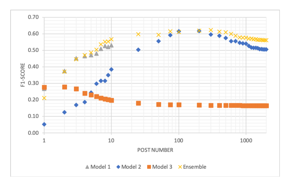
Fig. 2. Model performances based on the number of posts processed for prediction of anorexia. Y-axis is in logarithmic scale.

The performance of the models changes based on the number of posts that they process. Figures 2 and 3 show these changes for both task 1 and task 2, respectively. The performance of Model 1 increases up to around 10 posts for both tasks. The performance of Model 2 increases for about 100 posts for task 1 with the F1-score reaching a maximum at 62% and then it decreases slightly and appears to become stable around 1200 posts with an F1-score of 50%.