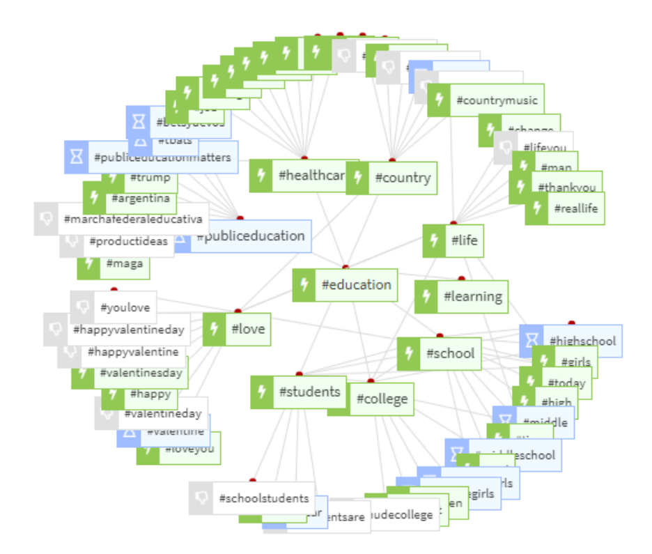
Fig. 4. Graph of hashtags related to #education

The graph of hashtags related to #education is designed based on software Ritetag. This graph in Fig. 4 is presented.