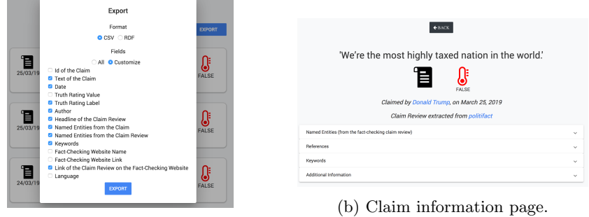
(a) Data export options.