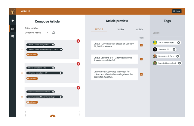
Figure 3: Page for the revision of the lexicalized triples.

We used different databases to avoid redundancy and give a fluent text to the reader. Some online resources help us to create a list of possible replacements for a team or players' name. Using DBpedia, we can find a nickname for an entity (Real Madrid players are also called Blancos or Merengues ). Other resources we used are Wikidata list of soccer teams nicknames and Topend Sports database.