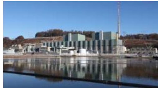
Fig. 1. The Peach Bottom NPP

have one common critical feature - the «failure» of the human factor.