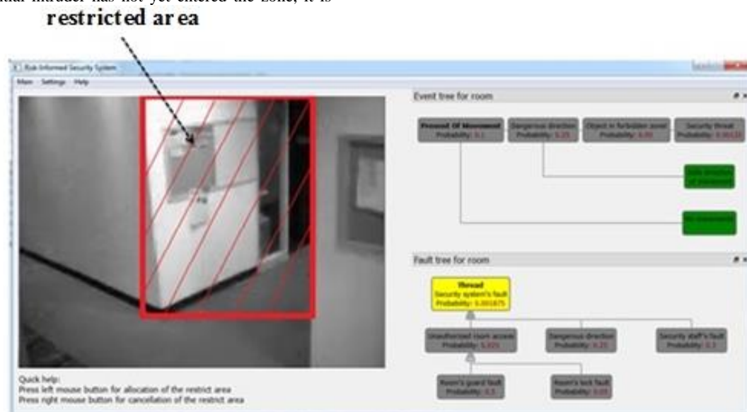
Fig. 4. Program window. The room (real-time picture from the video camera), the «restricted» area in the room, the event tree (top) and the fault tree (bottom)