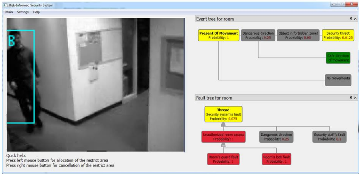
Fig. 5. Intruder detected moving towards restricted area