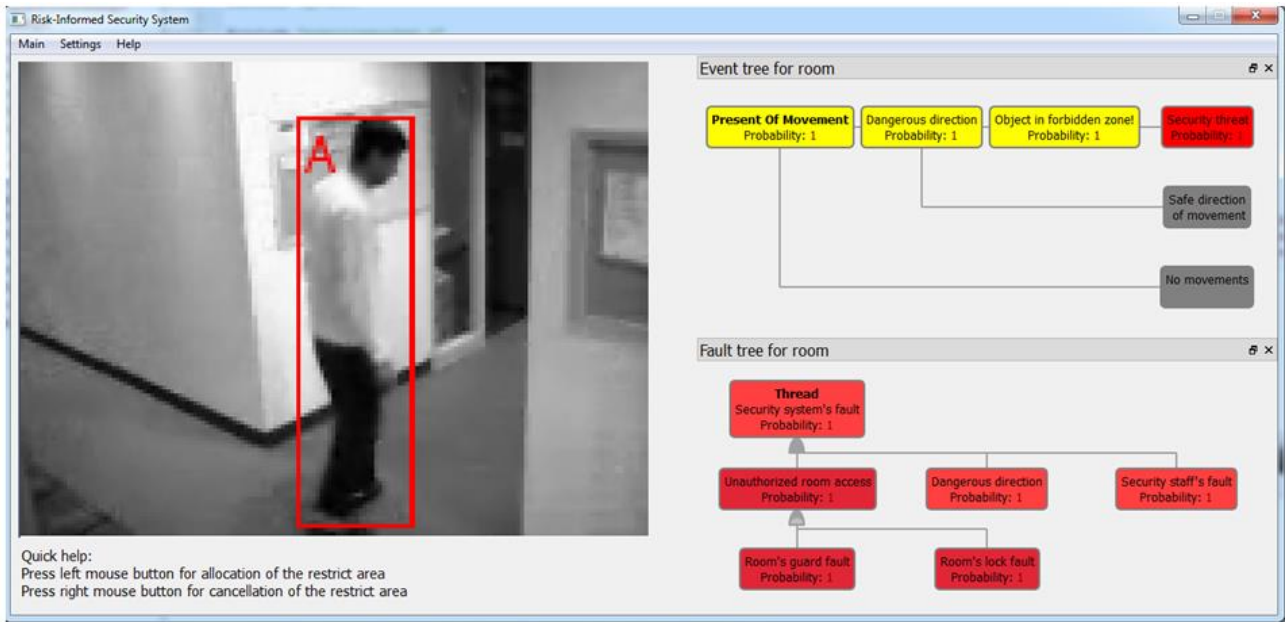
Fig. 6. The intruder entered the restricted area. PPS failure

The assessment of the scale of the invasion is characterized by the time spent by intruders in the control zone by television cameras, their tactics of overcoming this zone, time of day, light exposure, etc. Depending on these data, it is possible to select the closest of the intruder's actions available in the database, obtained at the stage of the analysis of effectiveness and modeling, and predict the most likely actions of the intruder, the most likely routes and goals, and, as a result, quickly organize adequate countermeasures.