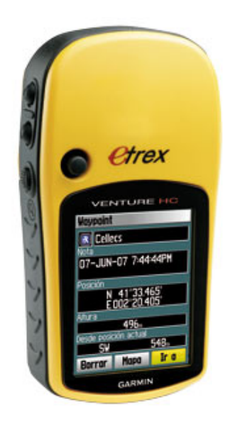
Fig. 5. GPS, it was used to measure distances.

measurements and only 3 shots were dismissed. It is important to mention that the speed of sound is independent of the pressure, the frequency and the length of the waves [4], that is why these factors did not interfere with this research.