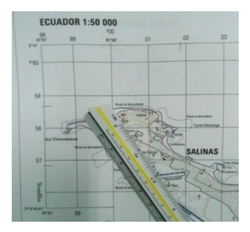
Fig. 4. Topographic Map, which is used to measure distances through scales.

The sparks ignition is immediate and it can be seen by the human eye, it represents the reference to start timing using the chronometer, it stops once the gunpowder explosion is heard. The distance is determined in exact coordinates using a topographic map and a GPS which measured 1240 mts; there were collected eight samples per student and; as a result, it was gathered 357