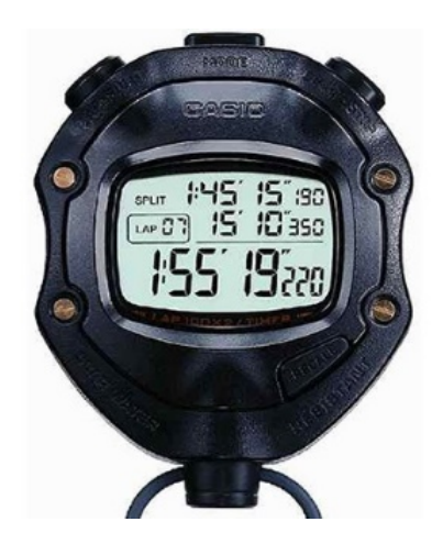
Fig. 7. A Casio chronometer.