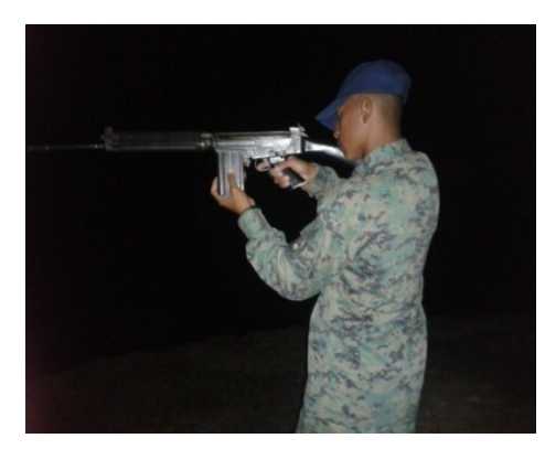
Fig. 3. Each student had 8 attempts.

Determination of the Speed of Sound to Calculate Distances 273