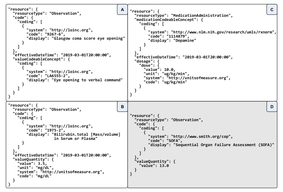
Figure 5. FHIR-JSON example (A-C: input resources; D: output resource)

modelled as property assertions based on the has value relation (e.g., "has value 10" for Dopamine). On the other hand, a composite phenotype is defined as instance of the class cop:Composite Phenotype, which combines all the single phenotype instances using property assertions based on has part relation. In the first step (classification step), a standard reasoner classifies the single phenotype instances in restricted classes. In our example. the instance of Eye_Opening is classified in class the Eye_opening_to_verbal_command, the instance of Bilirubin - in the class Bilirubin s ge 2 0 1 6 0 (i.e., the Bilirubin value is \geq 2.0 and < 6.0 mg/dL), the instance of Dopamine – in the class Dopamine s g 5 0 le 15 0, etc.