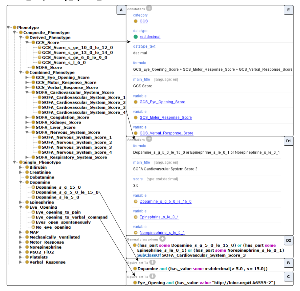
Figure 4. Parts of the SOFA PASO in Protégé

The final step is to define the SOFA score as NDeP class and to specify the formula 'SOFA_Cardiovascular_System_Score + SOFA_Coagulation_Score + SOFA_Kidneys_Score + SOFA_Liver_Score + SOFA_Nervous_System_Score + SOFA_Respiratory System Score'.