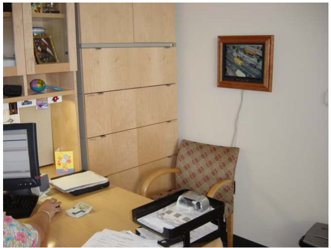
Figure 8: Example deployment of InfoCanvas.

The main idea of the system is that different objects in a scene can be set to represent different items of awareness information of interest. When the underlying data being monitored changes, then