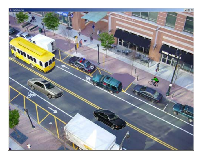
Figure 9: Sample InfoCanvas scene. Colors, appearance, and positions of objects such as the cars, lights, people, trees, etc., all indicate the present state of information of interest.

the corresponding object's representation in the scene is updated appropriately. Objects can change appearance, color, position, and size, or can be made invisible to represent different data states. For instance, in the example scene shown in Figure 9, the number of cars on the street could indicate stock performance that day or the level of traffic on a drive home. The position of the bicyclist could indicate tomorrow's forecasted high temperature or the current time of day.