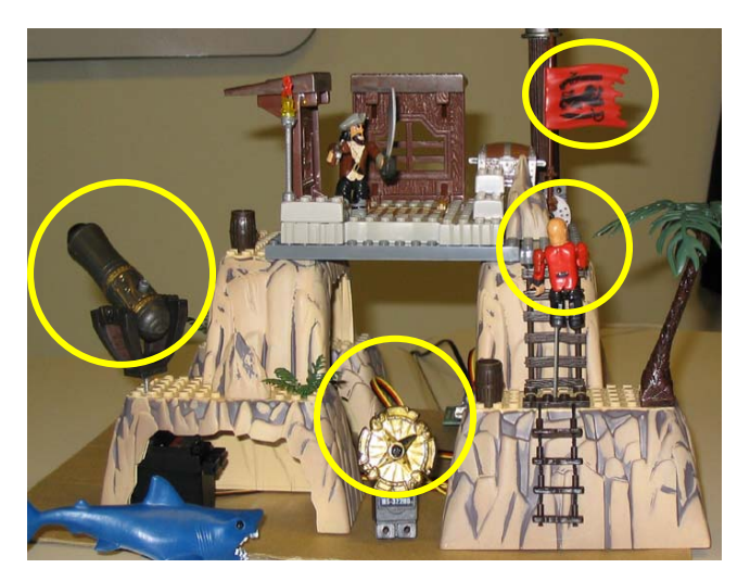
Figure 4: Pirate Island Information Display.

This project and the two others described later in the article illustrate one of the primary design goals of our work with ambient information systems, a desire to consolidate multiple pieces of awareness data within one system. Many ambient displays developed previously have focused on one particular nugget of information. In contrast, we wanted to explore whether multiple data streams could be combined into one coherent display and whether people viewing the display could easily digest all the different information.