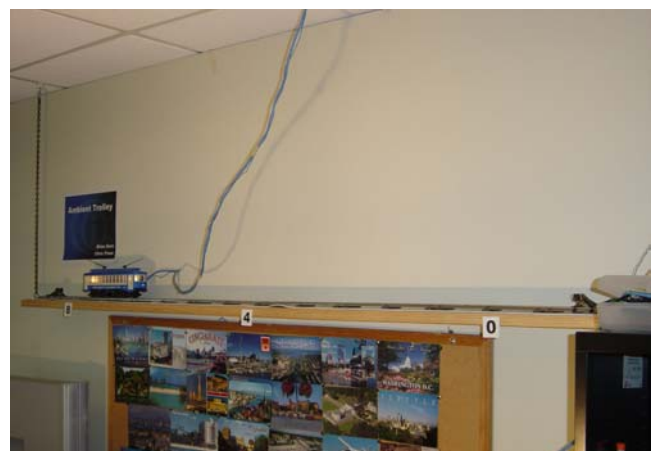
Figure 3: Configuration of Ambient Trolley showing tracks and positional markers used to indicate distance from trolley stop.

HTML is then parsed for the next predicted arrival and this value is used to reposition the trolley. The controller application itself is rather plain, allowing a user to start or stop the display, indicating the current arrival time depicted by the trolley, and providing access to diagnostic functions like moving the trolley car along the track manually.