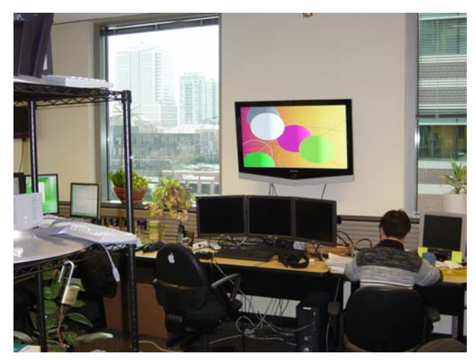
Figure 5: AuraOrbs display deployed in the laboratory.

In the AuraOrbs system, we have mounted an RFID reader on the pole of a wire shelf near our lab entrance. Lab members swipe their RFID tag past the reader when they enter and exit the lab. Software running on a computer connected to the reader detects each swipe event, determines who the person is, and updates the information display. The display control system also monitors the RSS feeds and updates the view as appropriate to the most recent information received.