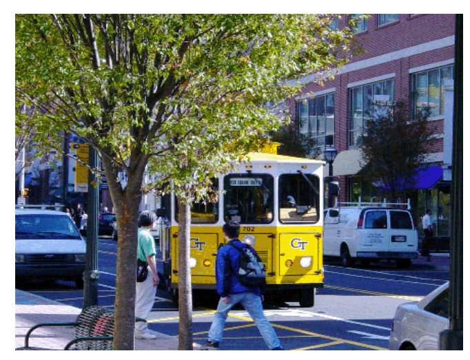
Figure 1: Actual trolley running on campus.

an awareness of the trolley's position and suggest a good time to leave the lab to meet the trolley.