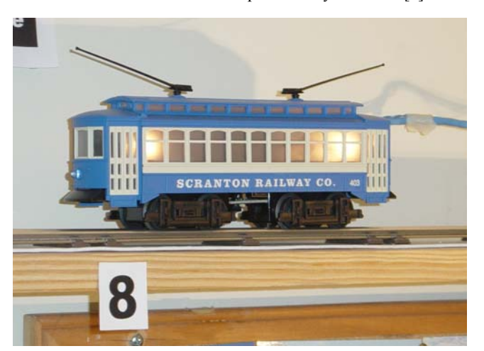
Figure 2: Ambient Trolley up-close.

The trolley car is controlled from a PC hidden nearby. A Phidgets [2,3] interface board is used to control various lights and motors on the trolley car, as well as relaying input from endpoint switches to the controller application. At regular intervals, the application retrieves a simple web page containing estimated arrival times based on GPS data provided by NextBus [4]. The