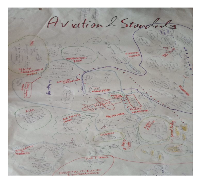
Figure 1. Sample: Rich Picture of the Aviation Operations Ecosystem Team.

they got stuck with a question or were lacking background knowledge. Over the course of a few hours, they worked their way through the dimensions, engaged in vivid discussions with each other, and drafted their initial versions of the Sustainability Awareness Diagrams.