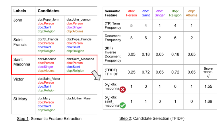
Fig. 2. The TF-IDF approach

Semantic features A simple approach to capture semantic coherence is to assume that all entities in a column belong to the same ontology class. The most specific class of all or most cells in a column, as computed in the CTA task is informative, but not specific enough. For example, in Wikidata, all humans are instances of class Human (Q5), and the set of athletes is identified using the occupation property. We investigated a generalization of this idea to use all properties used to describe entities, in addition to the instance of property that identifies the classes of an entity.