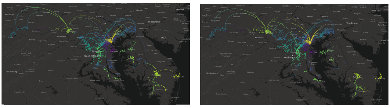
(a) February, 2015