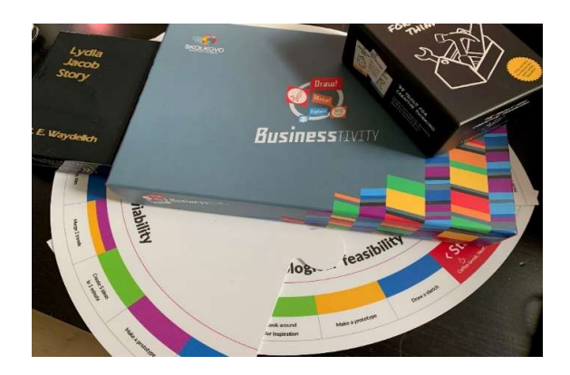
Fig 3. Business storyboard cards and games.

Harmonization of current game-oriented software-based approaches for a better understanding of business processes [16] and physical card/storyboards such as SAP Scenes method can be a very effective way of bringing management education in Innovations to the new level. We use a hybrid approach specifically for MBA, EMBA, and MSc in Information Systems students they are very much capable of dealing with mobile apps as part of day to day business, and physical cards are a great tool to create a tangible experience. In fact, tangible experience is an essential ingredient for successful Design thinking management education. Below, some examples of storyboards cards and games (Fig 3).