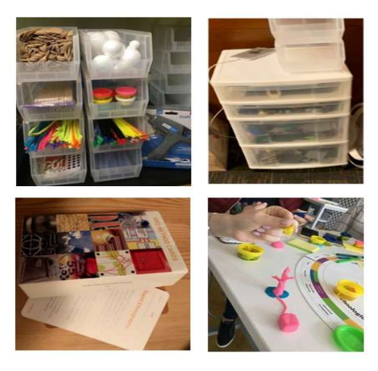
Fig.4. Prototyping tools

Prototyping tools examples are presented below.