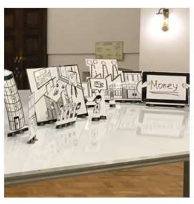
Fig 2. Use of SAP Scenes for Ideation and Prototyping

Harmonization of current game-oriented software-based approaches for a better understanding of business processes [16] and physical card/storyboards such as SAP Scenes method can be a very effective way of bringing management education in Innovations to the new level. We use a hybrid approach specifically for MBA, EMBA, and MSc in Information Systems students they are very much capable of dealing with mobile apps as part of day to day business, and physical cards are a great tool to create a tangible experience. In fact, tangible experience is an essential ingredient for successful Design thinking management education. Below, some examples of storyboards cards and games (Fig 3).