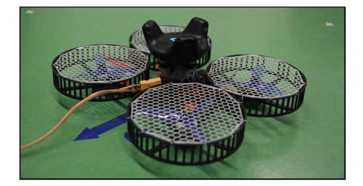
Figure 1: Custom drone build from of the shelf components. A mounted HTC Vive tracker enables low-cost tracking. We 3D-printed a rotor case for direct human-drone interaction.

LMU Munich, Munich, Germany {firstname.lastname}@ifi.lmu.de