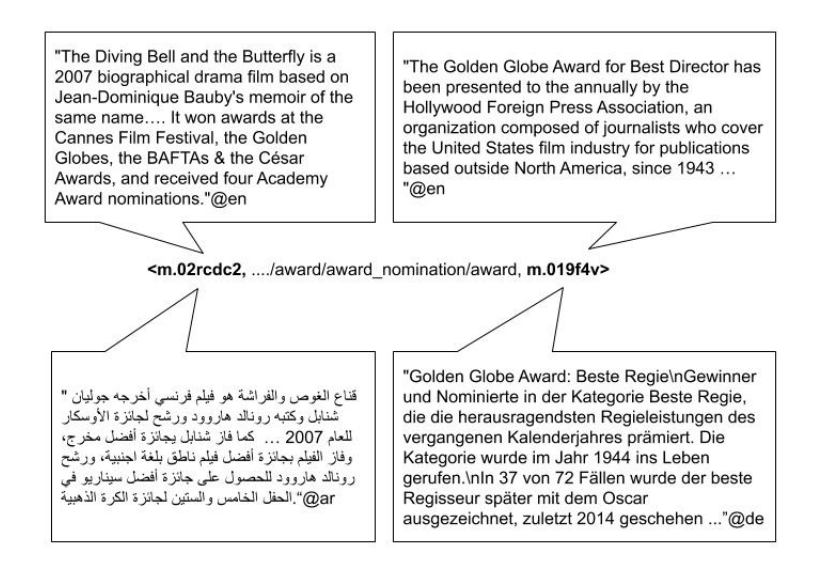
Fig. 1: A triple in FB15K with multilingual descriptions of the head and tail entities from Freebase.

In most of the popular KGs, a single entity can have descriptions in two or more languages where the contents of the descriptions are different. This fact is demonstrated in Figure 1 using, as an example, a triple from FB15K with some of the descriptions of its head and tail entities extracted from Freebase. In this example, it can be seen that, for both the head ('m.02rcdc2') and tail ('m.019f4v') entities, the description provided in one language contains information that is not available in the description given in the other language. Hence, a KGE model which uses entity descriptions only in one language discards the extra information provided in the descriptions in other languages.