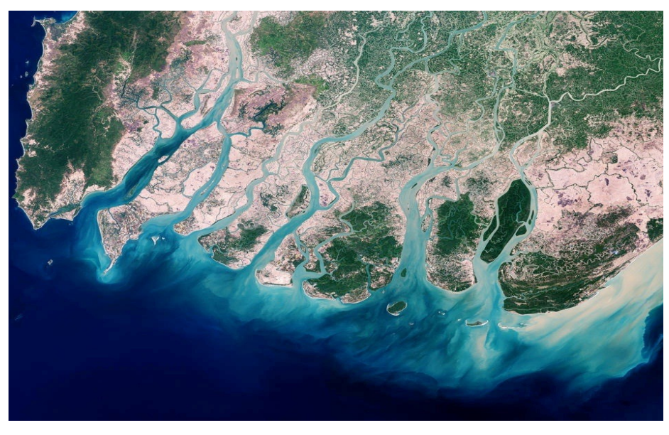
Fig. 1. The Iravadi River Delta (Myanmar). Satellite image, ISS