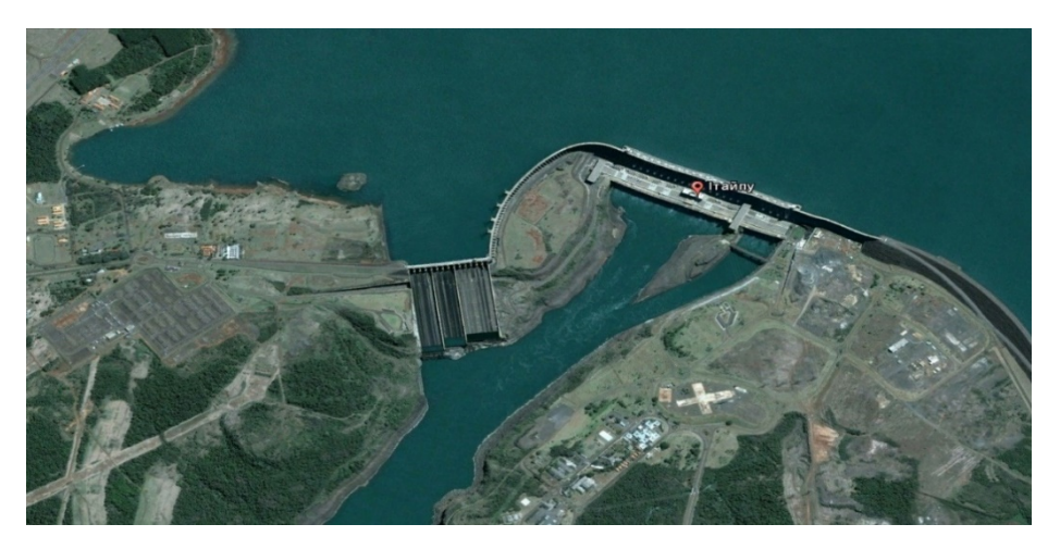
Fig. 3. Satellite image of the Itaipu hydroelectric station on the border of Brazil and Paraguay. Obtained using Google Earth Geosource