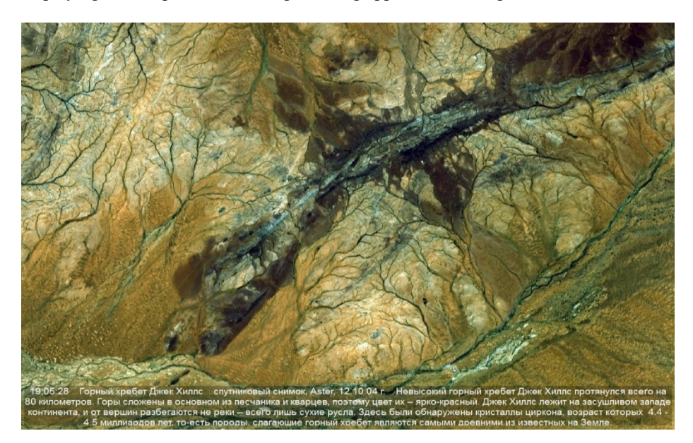
Fig. 6. Satellite image and its characteristics in the educational database of the ERS

mouse or the keys if it is not placed completely on the screen; Go to the next, previous, first and last image in the current watch list switching from window to full screen and back; change the properties of the current image; switching the slide show on / off; displaying a description of the image; calling application settings, etc.