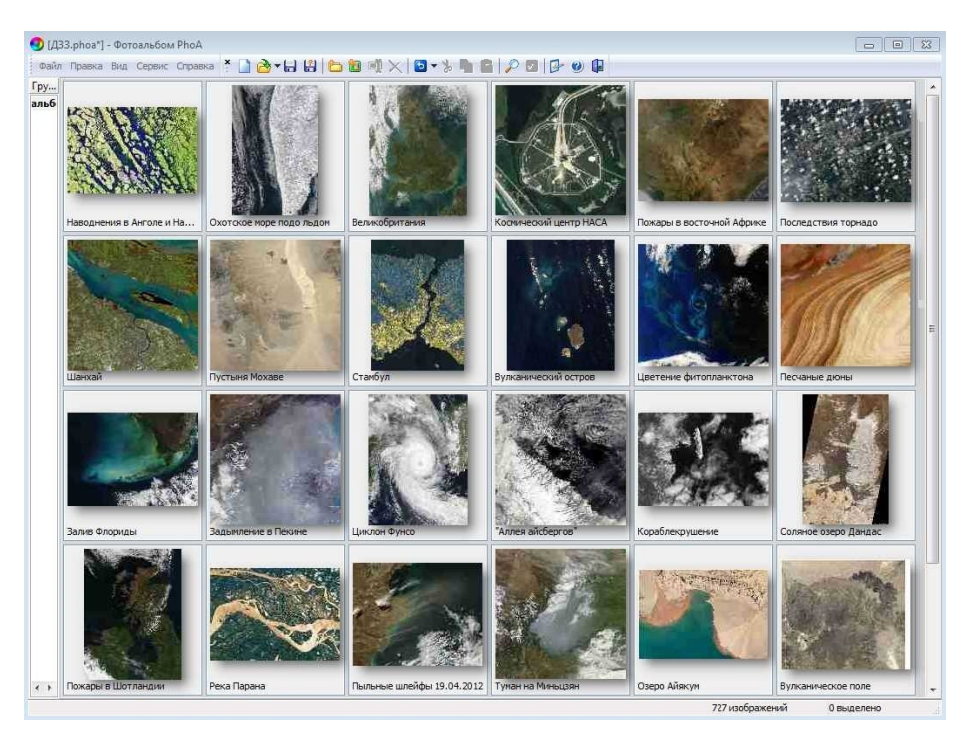
Fig. 5. PhoA Main Menu with aerial photos downloaded and dynamic models

Thus, PhoA program was used to work with the collection, which is a simple and sufficiently efficient database for digital image management. Fig. 5 demonstrates the main program window. This mode is the start for the application. The main window of the program is built on the principle of standard Windows Explorer: on the left there is a group tree, and on the right it shows thumbnails and descriptions of the images in the left group.