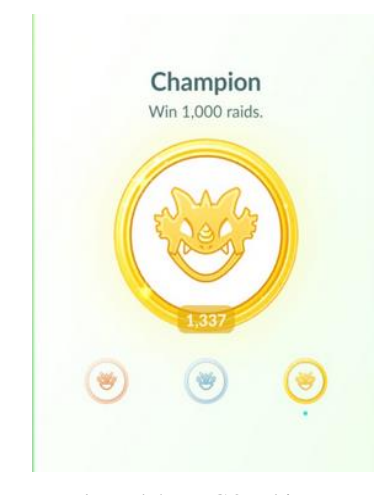
Fig. 2. A screenshot of an exemplar Pokémon GO achievement which players share to chat groups.

Random encounters. Random encounters with other trainers also regularly lead to social interaction and verbal communication between the players, as they may exchange information about the game and achievements or engage in in-game activities together. For example, giving tips about location of rare pokémon or sharing experiences in general can boost player's social capital.