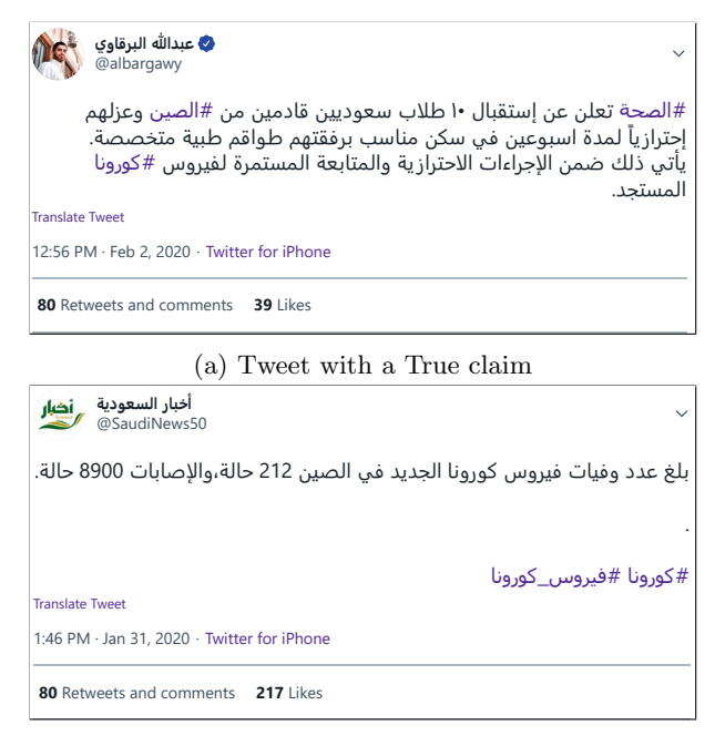
(b) Tweet with a False claim

Translation (a). Ministry of Health announced the return of 10 Saudi students from China. The students were placed in precautionary isolation for a period of two weeks in appropriate housing, accompanied by specialized medical teams. This comes as part of the precautionary measures and continuous monitoring of the Novel Coronavirus.