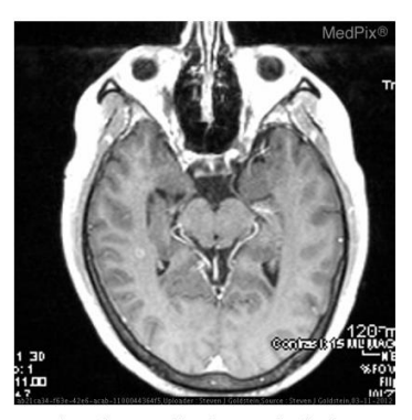
Q. what abnormality is seen in the image? A. carcinoma, small cell

Fig 1 Examples from VQA-Med-2020 dataset