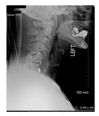
Q. what is most alarming about this x-ray? A. c-spine fracture

Fig 1 shows few examples of questions and answers from dataset.