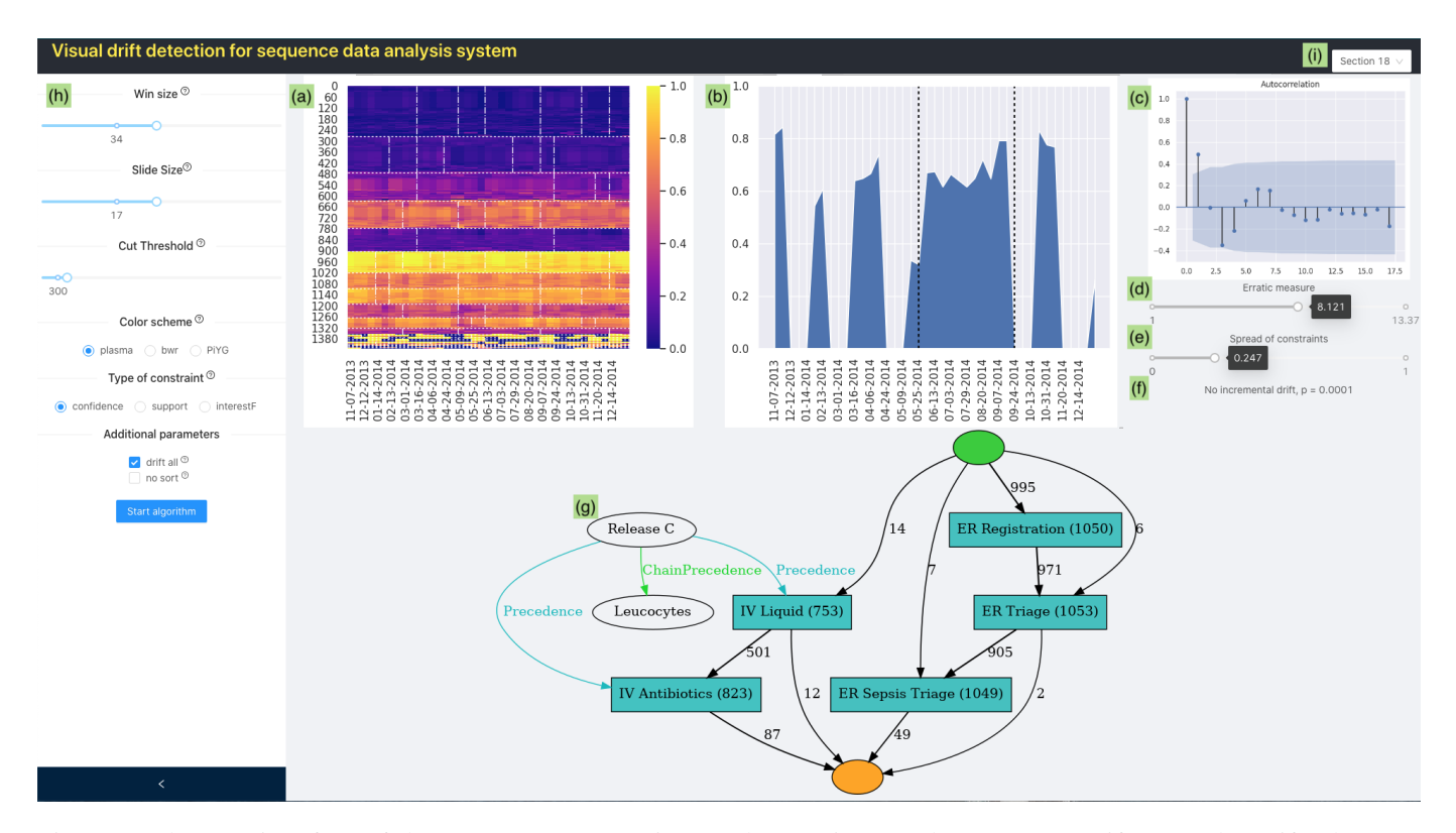
Figure 2: The user interface of the VDD system, running on the Sepsis event log [13]. (a) Drift Map. (b) Drift Chart. (c) Autocorrelation plot. (d) Erratic measure. (e) Spread of constraints view. (f) Incremental drifts test. (g) Extended Directly-Follows Graph. (i) Behavior cluster selection menu.