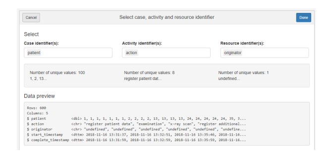
Fig. 1. Example of logbuildR interface: selecting appropriate identifiers.

standard transactional life-cycle model [4]. A screenshot of the graphical interface is shown in Figure 1. The logbuildR package is available on GitHub.<sup>2</sup>