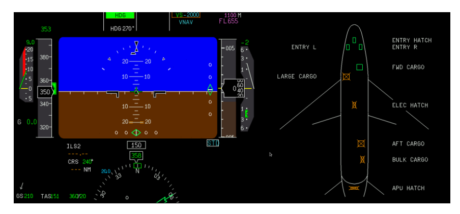
Fig. 2. Multi-window visualization of two applications - PFD and DOORS.