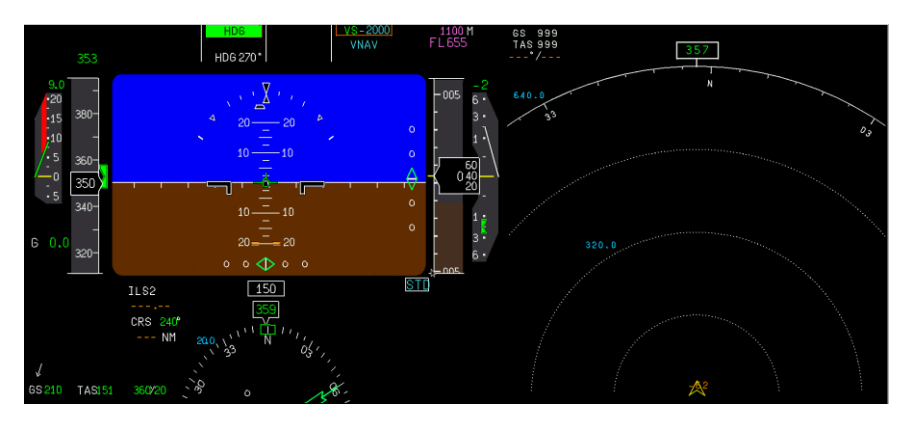
Fig. 3. Multi-window visualization of two applications – PFD and ND.

Table 2 shows multi-window visualization speed (in frames per second) for the software OpenGL (SWGL) and the hardware OpenGL (HWGL). Visualization via the SWGL library has the possibility to run each application with own instance of OpenGL and compositor on own processor core. Visualization via the HWGL uses the algorithm described in previous chapter. Column SWGL 1 presents speed for use of 1 core, while SWGL 3 – 3 cores were used.