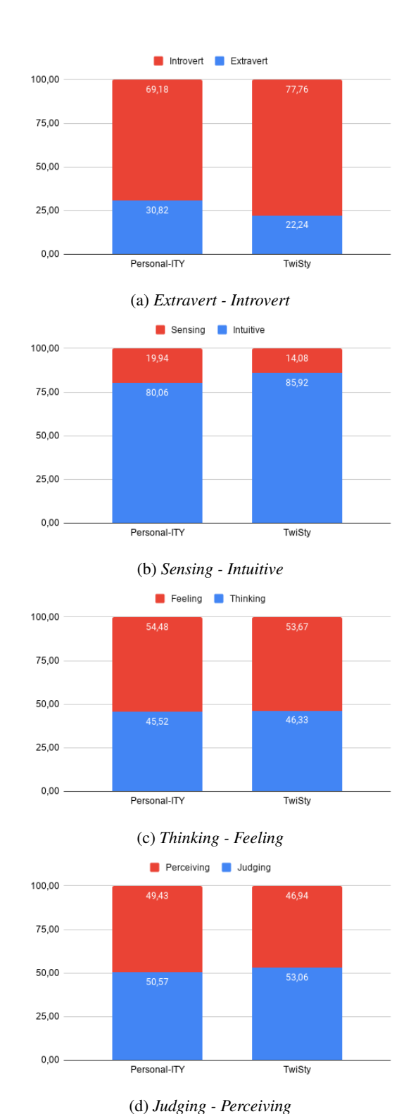
Figure 2: Comparison of the distributions of the four MBTI traits between Personal-ITY and the Italian part of TWISTY.

We ran a series of preliminary experiments on Personali-ITY which can also serve as a baseline for future work on this dataset. We pre-processed texts by replacing hashtags, urls, usernames and