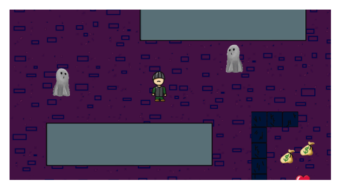
Figure 1. Stage 1: an example screen of the game

The simplest solution to create an emotional-changing environment was to revolve around the overall difficulty of games. While making the neutral, peaceful stage can relieve stress for the player, the loud and hard level can intensify the rage and increase heartbeat. Therefore, three genres have been selected: roguelike, platform, and maze. The first level is balanced to be an easy stage, supposed to develop energetic, happy emotions. On the contrary, the second level is extremely hard to beat, filled with traps, to give the sensation of unjust and fury. This juxtaposition is important to the study, given the sudden change. Last phase is neutral, without any emotion-boosting elements, it exists to check the player's decision-making, behavior and bodily changes due to previous irritation. Additionally, a proper collection of game patterns was implemented. For every stage, depending on what emotions it should boost, from that collection separate elements were chosen.