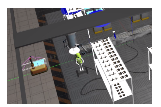
Figure 2: Robot about to collide with a human.