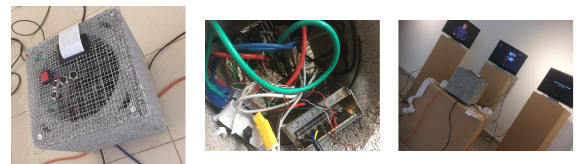
Figure 2: The bot.