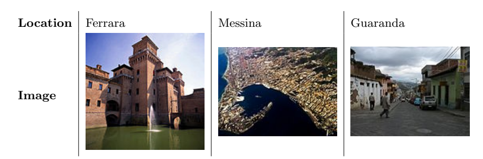
Table 3. Selected OEKG results of the SPARQL query in Listing 1.1.<sup>20</sup>