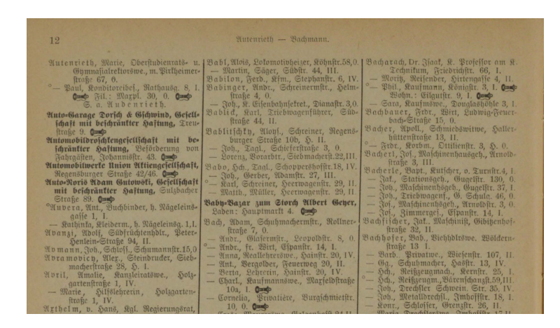
Fig. 2: A digitized page from "Addressbuch von Nürnberg 1910"

point in time. This allows researchers to gain a better understanding of the development of the city and its social networks as well as to add depth into a genealogical research of a family.