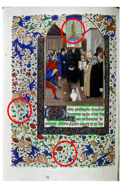
Fig. 5: Example of a challenging manuscript (Oxford, Bodleian Library, MS. Add. A. 185, fol. 106v). Red circles bring attention to areas of erroneous line detection.

For this particular manuscript, which includes a large border with foliate patterns and an illustration, the algorithm classified some areas of the decoration as text lines. These consisted mainly of vines which were sketched in pen. Although increasing the number of clusters did not improve the performance of our model, adding more features may. Another avenue for improvement that could be pursued is that of hybrid techniques (supervised and unsupervised learning). These would aim for model shrinkage (e.g. leveraging pruning and quantization for Deep Learning approaches) to further increase metrics while providing efficient inference models.