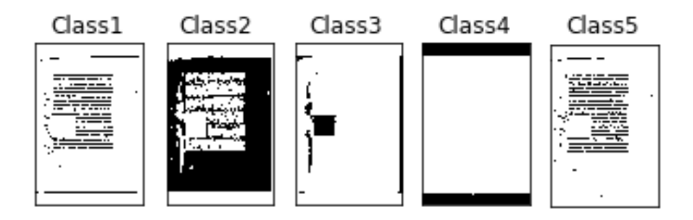
Fig. 2: Five classes obtained using k-means for one manuscript image. Each class represents one cluster. The points in the clusters are represented in black.