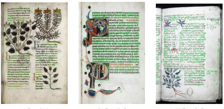
(a) Sample 1